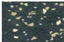
NO. 10518 Cocoa/Eggshell