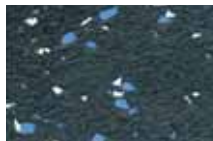
NO. 236 Blue/Grey