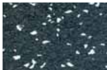
NO. 226 Grey