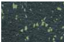
NO. 250 Green