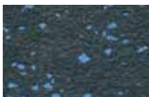
NO. 127 Blue