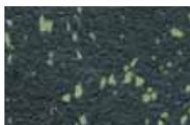
NO. 126 Green