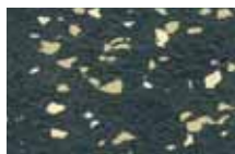
NO. 294 Cocoa/Eggshell