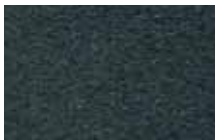
NO. 106 Black