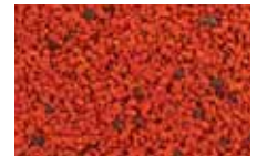
Desert Clay Red