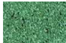
Alpine Meadow Green