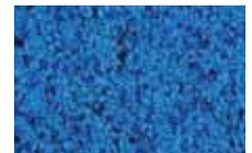
Crater Lake Blue